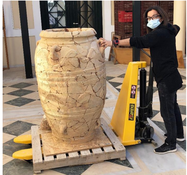
Figure 2. Pithos from the LM IB destruction of the large building at Gaidourophas.