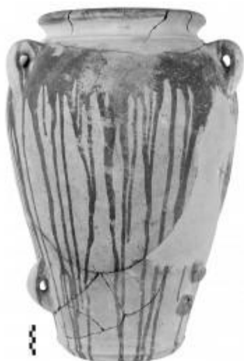
MM II pitheoid jar from Alatzomouri Pefka.