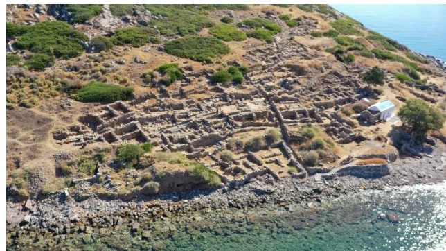
Figure 3. Aerial image of the team cleaning the island of Mochlos in preparation for new excavations.