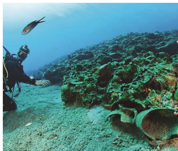
View of the shipwreck off the coast of Pseira Island.